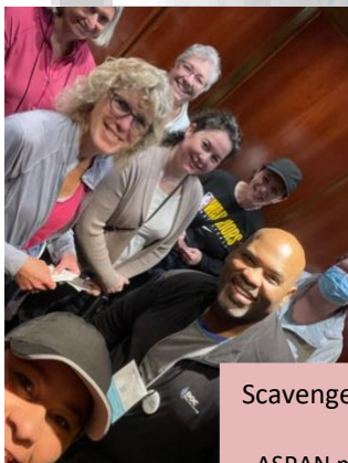
Scavenger Hunt to start off the conference ASPAN members from different regions coming together.