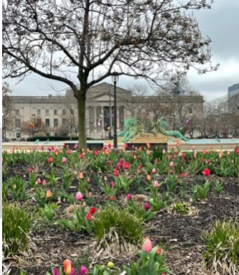
Center of Philadelphia, PA the Swann Memorial Fountain