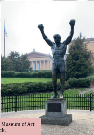
Rocky Statue with the Museum of Art in the back.