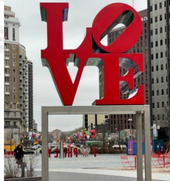
Love Park as you look down the Benjamin Franklin Parkway to the Museum of Art.