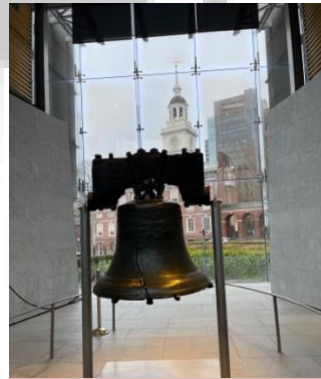
The Liberty Bell.