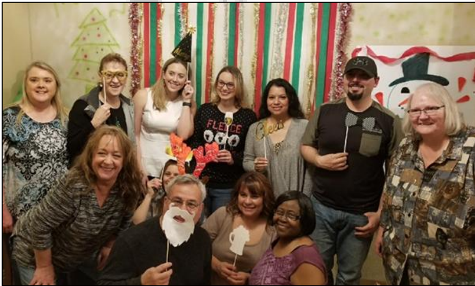
Midland Christmas party 2017